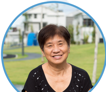
GUIDED BY COMPASSION